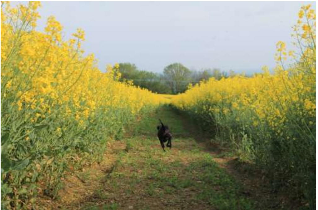
Photo courtesy of Barney Rudd of Platts Heath - More from Barney next month !!