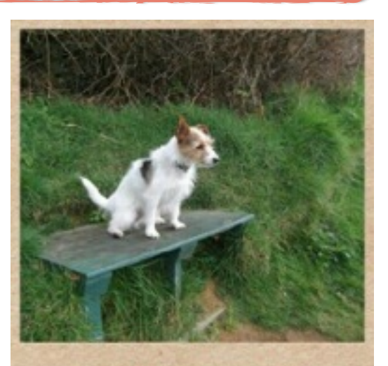
oh dear,forgot you bag. Please dont worry,we wont nag. Just find a nice stick And give it a flick