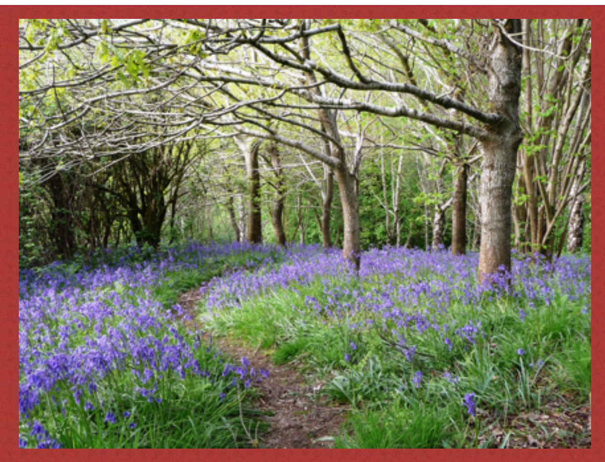
The bluebells will be at their best from next weekend (26th April)