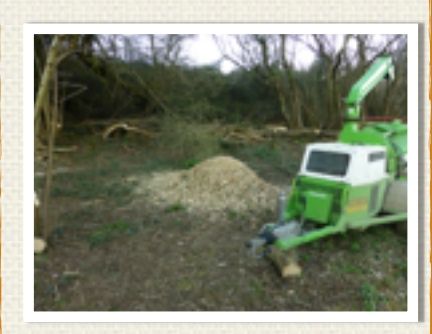
MATERIAL NOT SUITABLE FOR THE DEAD HEDGE WAS CHIPPED......