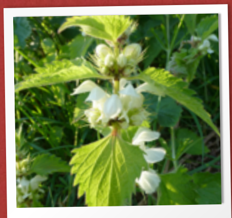
WHITE DEAD NETTLE