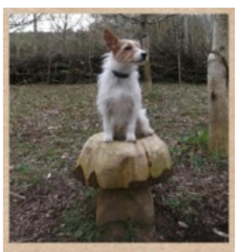
I love my dog I love yours too Lets all love this hill And pick up their poo

We need to thank local people for coming up with, I personally think a very positive campaign.