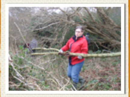
REMOVED MANY FALLEN TREES......