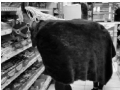
Flicka the panto horse will be back in 2020!