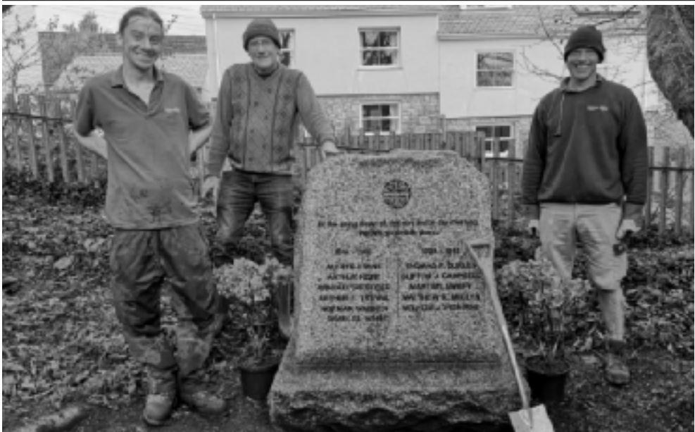
Some of the Grounds Team from Tremough helped spruce up Mabe Memorial Garden ready for the Remembrance Day parade on Sunday. One of the names on the memorial stone is that of a gardener from Tremough who died in WW1

To find out more, contact mabeshinty@gmail.com .