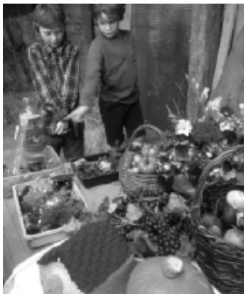
The annual Harvest Fayre took place in Halvasso on Sunday September 20th.

There were some great entries for the competitions, which included making a Fairy Garden and the largest vegetable!