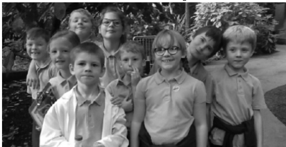
Some of Cormorant class at Eden

The charity depends on volunteers to operate and urgently needs to enlist more support.