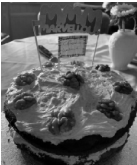
Above & Left: Cakes at The New Inn's MacMillan Coffee Morning

One, at The New Inn, raised £135.26, whilst the other at the Community Hall raised £701.05. Well done to both groups for their efforts!