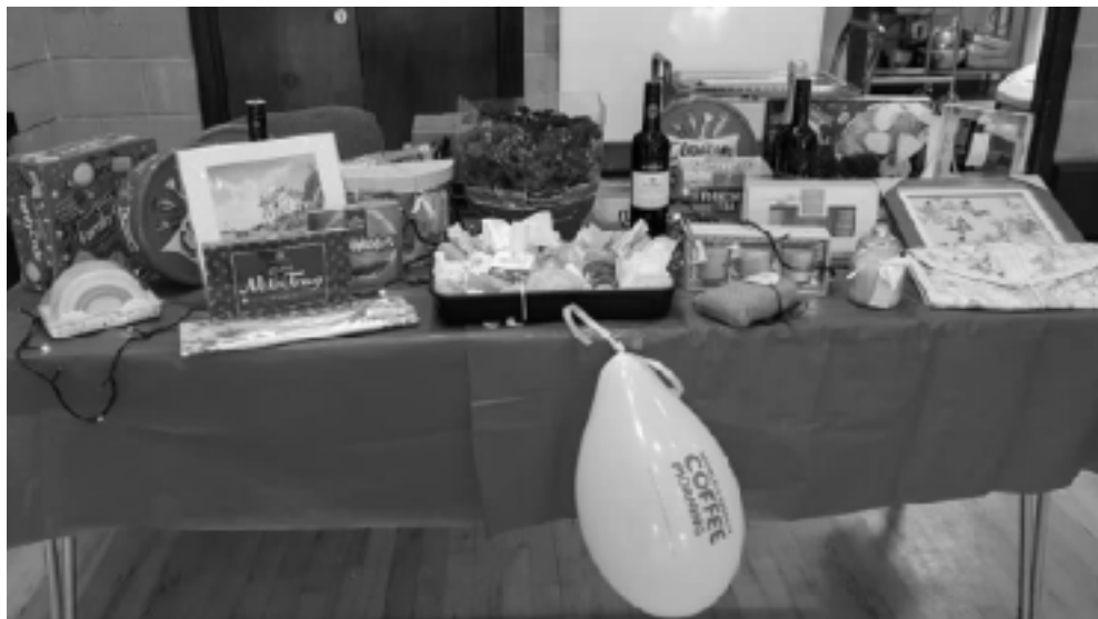
The raffle prize table at the MYCP MacMillan World's Largest Coffee Morning