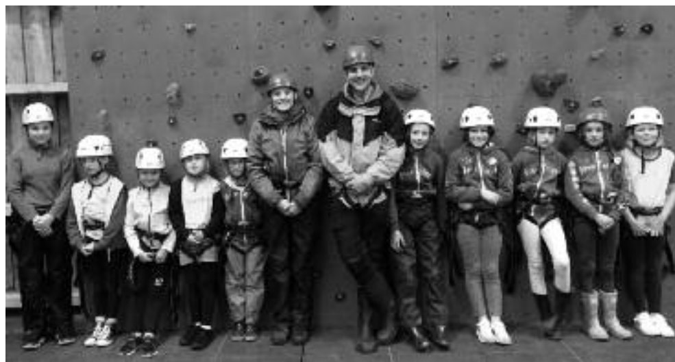
Mabe Brownies enjoyed a day out at BF Adventure during half term, where they had a go on the climbing wall and the giant catapult