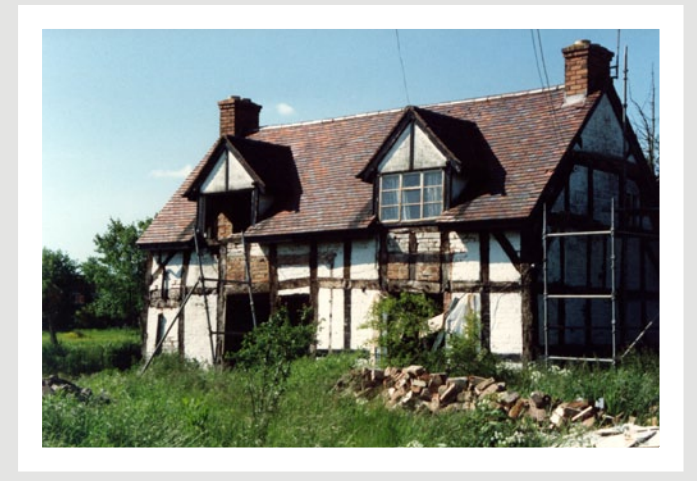
Garden Cottage, 1987

both Shrewsbury and Telford. However newer residents continue to give new life to the church and take leading roles in it and the wider community through the Parish Council and local societies. They have helped to keep the school open at Upton Magna.