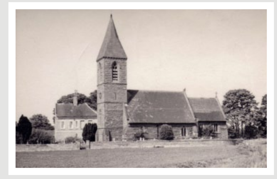
View towards Withington Church and The Old Hall

The population had become rather elderly, children moved away out of agriculture and, as houses came up for sale, they were bought by people who wanted to live in the country and had the means to modernise them. At the same time agricultural changes meant