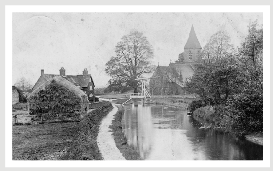
Postcard of the canal at Withington c.1908

The population of Withington in 1861 was 232; the village boasted a blacksmith, two wheelwrights, a shopkeeper and the landlord of the Hare and Hounds. The vicar's salary was £107 per annum; fortunately the Rev Halke was a man of means. The majority