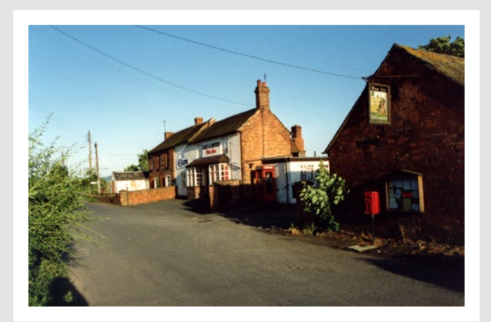
Withington, Hare & Hounds, 1987