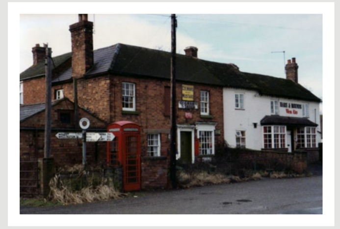
The Village Post Office and stores, Hare & Hounds pub, 1981