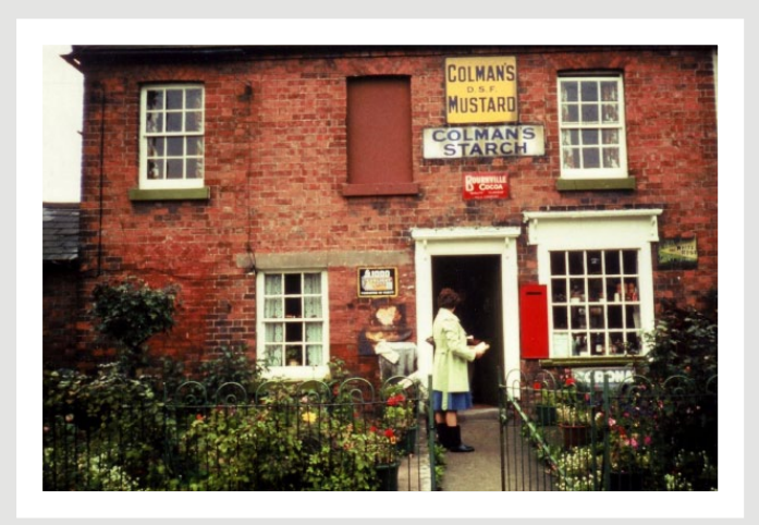
The Village Post Office and stores, 1981

A major achievement in 2007 was the Parish Council's acquisition of the land in