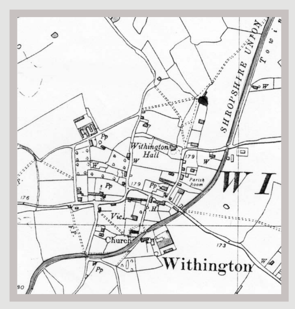
Detail of 1902 Map of Withington

it was more viable to create bigger holdings. The council began consolidating its holdings into bigger units as tenants retired and later began the process of selling them to the tenants if they wished or to the public. Only two holdings remained in 2003 as council holdings but