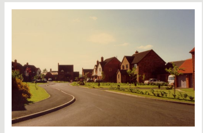
Woodlands Close, 1987