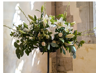
Easter Sunday flowers in Ripe Church

The Barley Mow at Selmeston has a bouncy castle on site and a two-courses for £22 meal deal today, Monday.