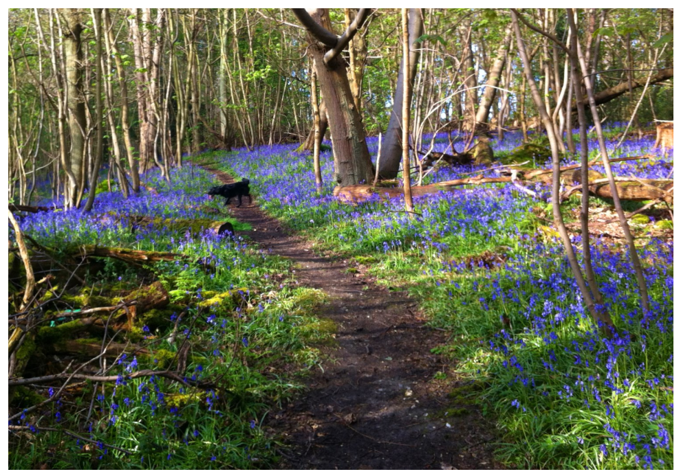
One of the many footpaths in and around our village.

What a lot there is going on in Dunton Green! We've got some really interesting articles for you, great information and all sorts of activities that you can get involved in.