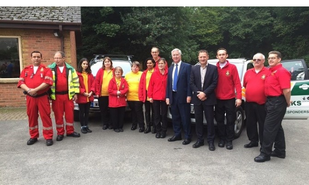
The Sevenoaks CFR Team

I look forward to meeting some of you out in the community soon, but In the meantime please all keep yourselves safe and well xxx