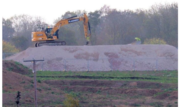
The Middleton of 2025-2045