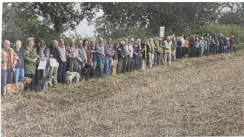
The villagers are calling on Sizewell C to consult with parish councils on the plans