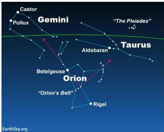
Taurus, Orion and Gemini

Constellations. The winter constellations are beginning to make their presence felt from the east this month, with Taurus (the Bull) and Orion (the Hunter) being the first of these. At around 10.00 pm, both of these constellations will be out towards the SE. Taurus has figured in many cultures over the years, and nearly always as a bull. In Greek myth the god Zeus, transformed into a large white bull to abduct and carry the princess Europa out to sea. This is why only the front half of Taurus is visible in the sky as, in myth, the rear half of the bull was submerged in the water. The 'V' shape of stars that form the head of Taurus, are in fact the star cluster Hyades , which is the nearest cluster to the Earth, being some 153 light years away. Although the brightest stars in the cluster form the distinctive 'V' shape (15 of these are visible to the naked eye), binoculars or a small telescope will reveal dozens more. There is a second star cluster within the constellation of Taurus, the Pleiades (or the Seven Sisters) which is easily visible to the naked eye. As the name suggests, there are seven stars that are visible unaided, but binoculars will reveal most of the 1000 stars that form this cluster. Also, look out for both The Plough or Big Dipper within Ursa Major (the Great Bear), and Ursa Minor (the Little Bear), out towards the north as they are always easy to locate at this time of the year.