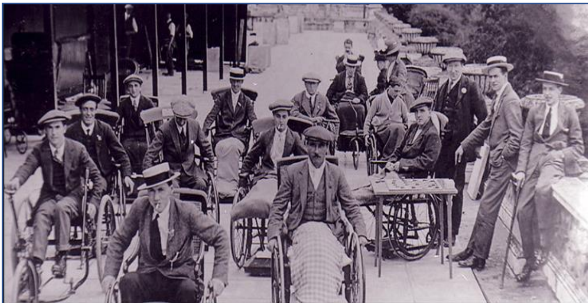
Above: Image of severely injured soldiers recuperating at the Richmond Star and Garter Home c 1916 with kind permission of © The Royal Star and Garter Homes.

You can read about its interesting history here: https://starandgarter.org/about-us/history/