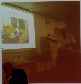
The last campaign

Left top picture - Presenting at Conference in Winter Gardens in Eastbourne - picture courtesy of Kevin Stevens.