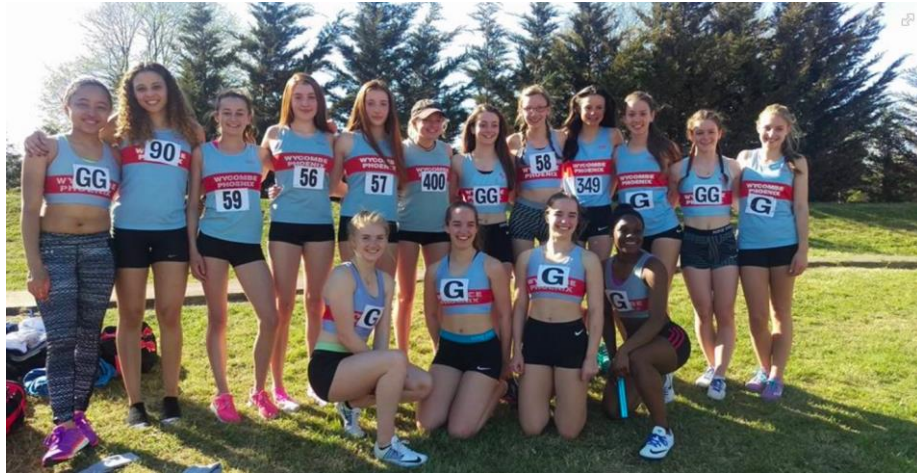
Wycombe Phoenix Harriers - A great way to spend your weekend