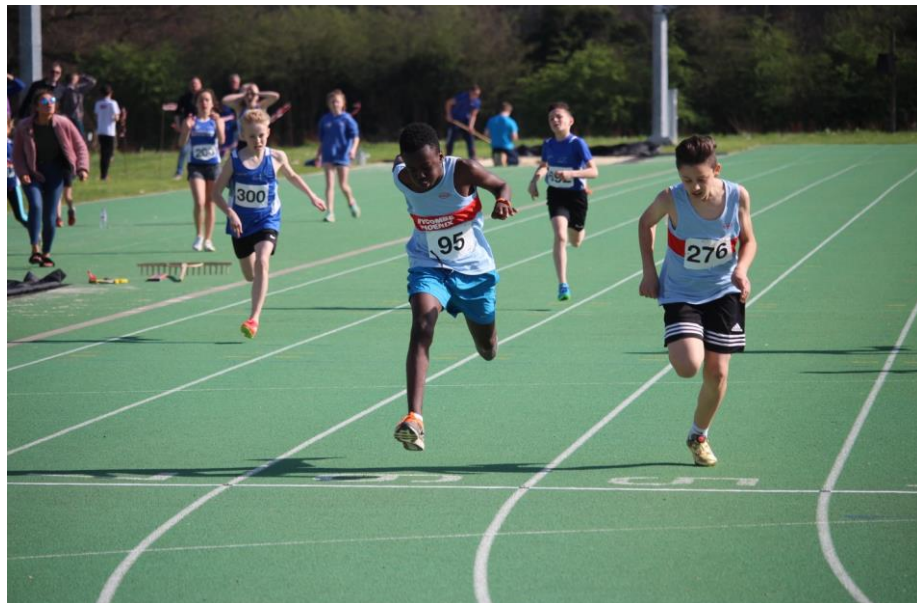
Competitive and fun!