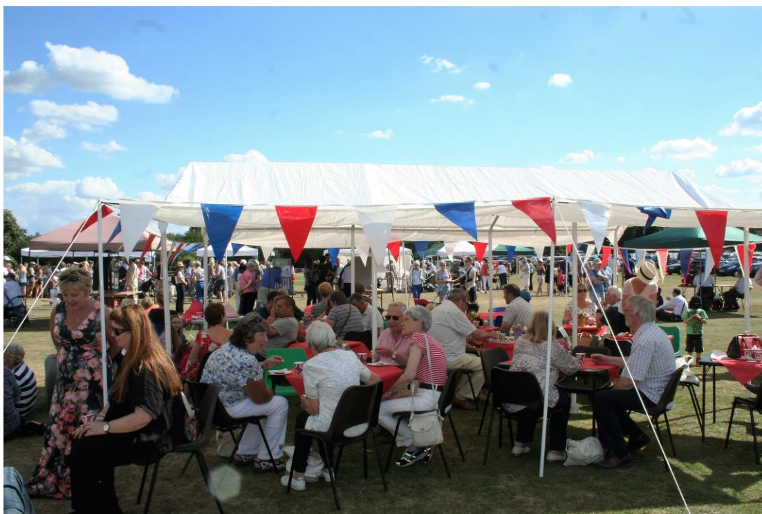
Afternoon tea at Little Marlow Village Fete, 2016