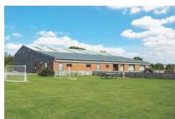
BSA Sports Centre