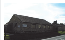
Swinton Reading Room And Community Hall

Cost for children's parties is flat rate of £10. Contact Dianne, 01653 697548