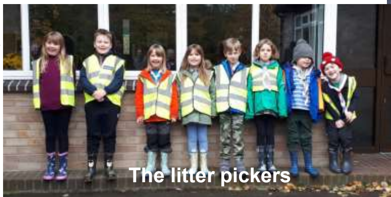
The litter pickers

especially in trimming back two big areas of very vigorous brambles, and getting a large pile of rubbish burnt.