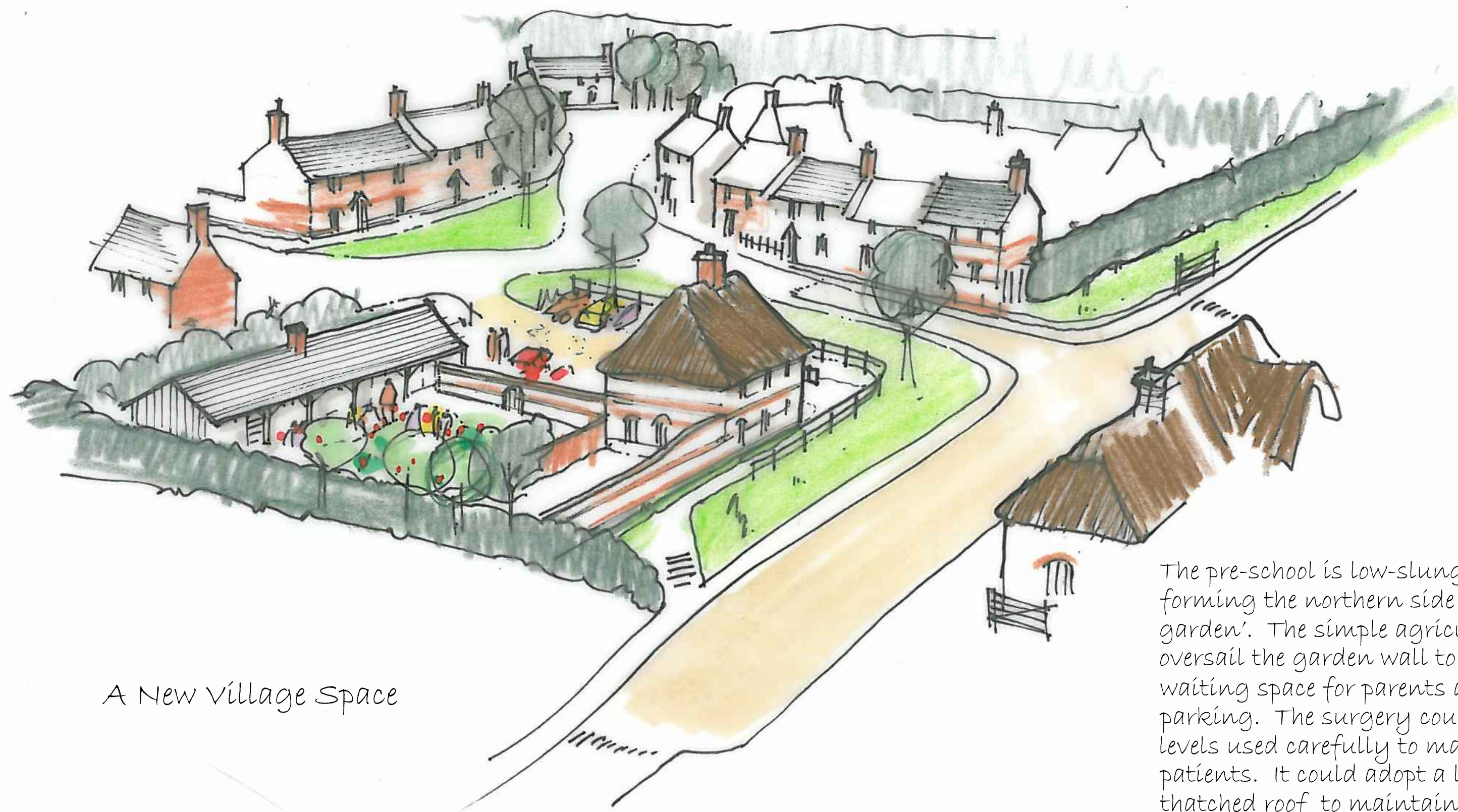
A New Village Space

The pre-school is low-slung and simple in form, forming the northern side to a secure 'walled garden'. The simple agricultural form can oversail the garden wall to provide sheltered waiting space for parents adjacent to an area for parking. The surgery could be two storey and the levels used carefully to maintain privacy for patients. It could adopt a locally distinctive thatched roof to maintain a good visual connection to the old bakery.