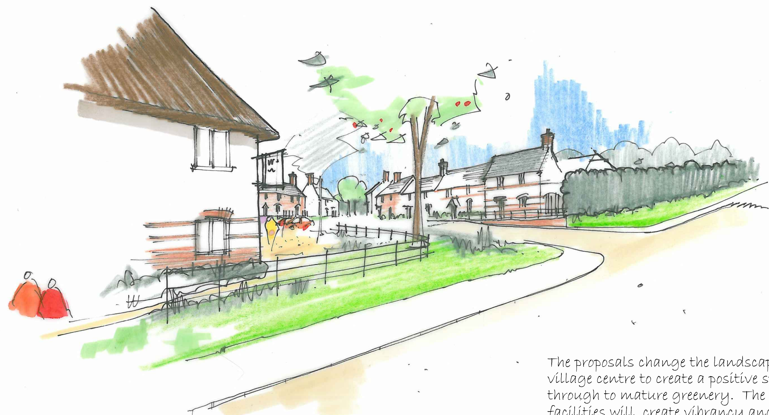
Approach from west

The pre-school is low-slung and simple in form, forming the northern side to a secure 'walled garden'. The simple agricultural form can oversail the garden wall to provide sheltered waiting space for parents adjacent to an area for parking. The surgery could be two storey and the levels used carefully to maintain privacy for patients. It could adopt a locally distinctive thatched roof to maintain a good visual connection to the old bakery.