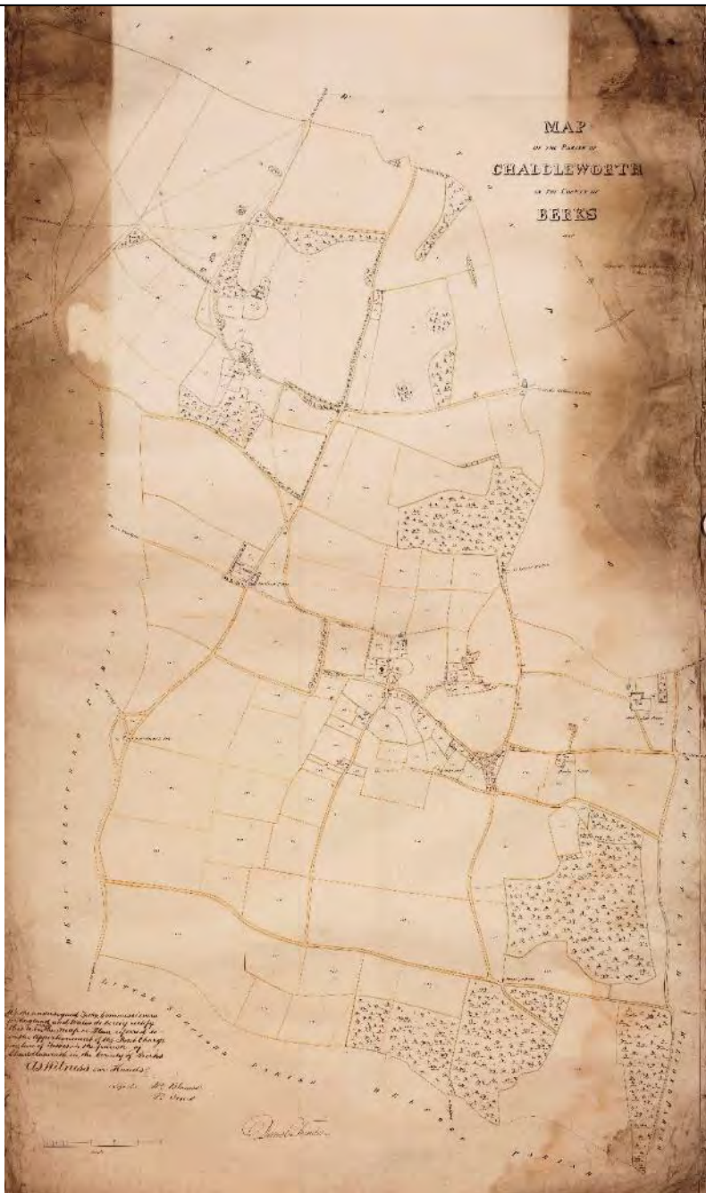
Pictured: Diocesan Tithe Records 1837-1948, Chaddleworth Tithe Records, '3 rolls', Royal Berkshire Archive (also displayed in Chaddleworth Village Hall)