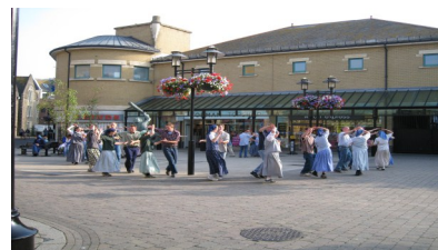
BELOW HASTINGS UK 9.8.2012