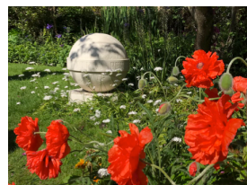
Sculpture depicting the town's motto, Per Bellum Patria Through Battle the Land and the Nation