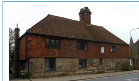
The Almonry, High Street, Battle

Battle is famous for being the site of the battle between King Harold and William, Duke of Normandy in 1066. The civil parish of Battle is on the edge of the High Weald and contains an Area of Outstanding Natural Beauty, a Site of Nature Conservation Importance and various wildlife meadow areas that are helping to restore and enhance wildlife habitats.