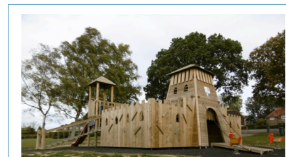
Play Castle in the Rec, North Trade