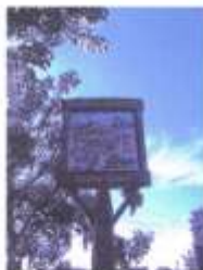
Boughton Malherbe village sign. (Ref no. TW2)