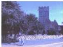
St Nicholas, Boughton Malherbe, the Wotton family's parish church. (Ref no. TW1)