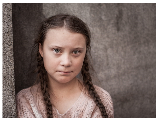
Greta Thunberg.

Second, the House of Commons, Dorset Council and over 600 other national and local government bodies worldwide have declared a climate or climate and environmental emergency. It's their view, and ours, that we are facing a real emergency. You may have heard David Attenborough talking about it, or the young campaigner Greta Thunberg. The UN's Intergovernmental Panel on Climate Change said last year that "We have 12 years to limit climate change catastrophe".