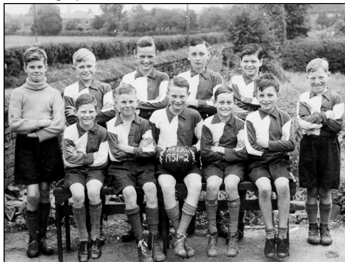
HALAM SCHOOL FOOTBALL TEAMS 1951-2 & 1997-8 NAME THOSE BOYS!