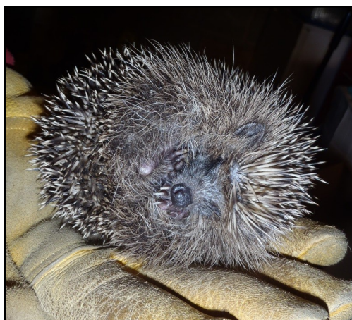
Nell, the smaller of the two young hedgehogs rescued on Ruby's Avenue.

It is now hoped that the two young hedgehogs, now named Hercules and Nell, will both make a full recovery and go into hibernation once their medical problems have been dealt with and their body weight increased to the prescribed 500g. In fact I am hoping to foster one over the winter so that it can be returned into its natural habitat next Spring.