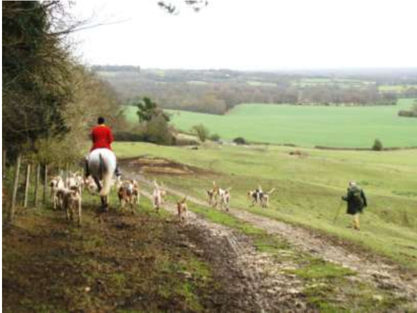
at the top of Church Road Boughton Malherbe