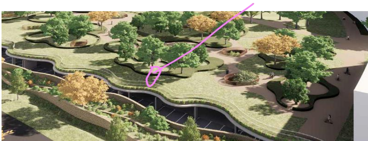
Figure 2: Illustrative view looking east (pp 18/19)

Please also supply an image to show this aspect from A1301 street level (a matter also raised at the 25 th April 2023 meeting). It appears that the car park 'lid' will be significantly higher than the top of the serpentine walls, and we wish to understand the associated visual impact at eye level.