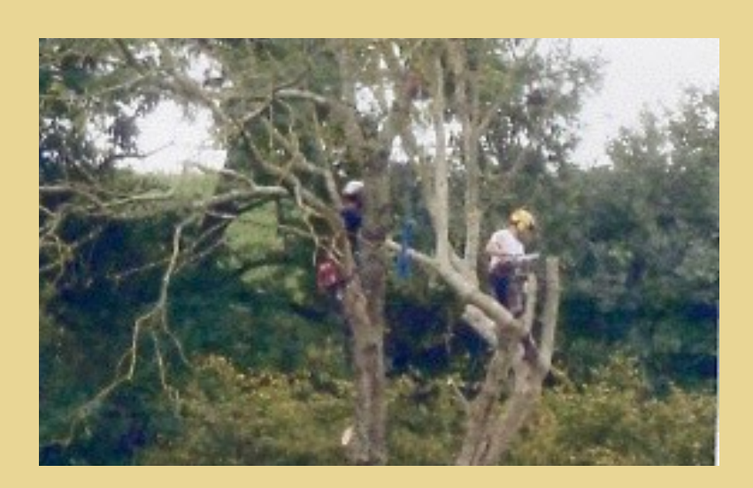
Specialist contractors were called in to cut down three ash trees.