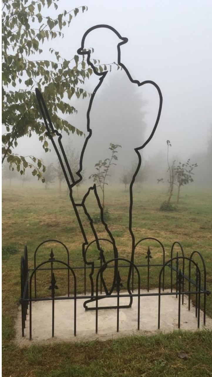
Photo of one the Memorial Wood soldiers.