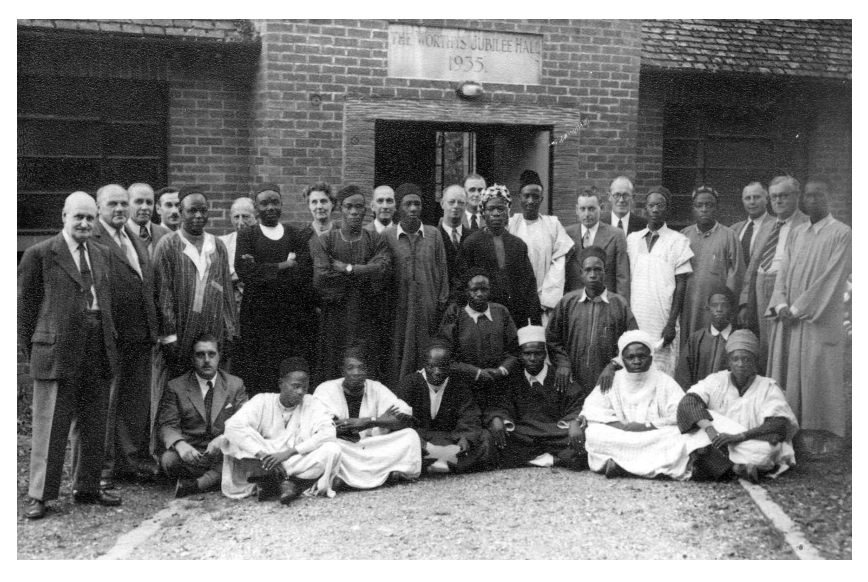
Nigerian visitors in 1953

House of Representatives, a headmaster, town clerks and other officials. They toured the Worthy villages by coach in the morning, visited St Mary's church, and had lunch at Morton House before going on to other parishes. They returned in the evening to attend a meeting of the Kings Worthy Parish Council in the Jubilee Hall, when they were able to study at first hand local government as practised by a typical parish council!