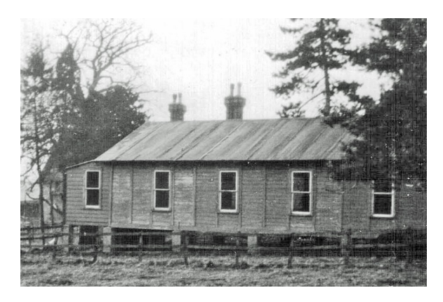
The Parish Hut

had 'visions of leading parishioners well wrapped up in the nether part with rugs, but hands and feet frozen ... [and I do] not know how many cases of illness were brought on through the discomforts of the old Hut.'