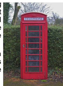
The Hodsoll Street Defibrillator will be installed here