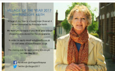
PKVOTY Flyer.jpg 1475K

This email and any attachments are confidential, legally privileged and protected by copyright. If you are not the intended recipient dissemination or copying of this email is prohibited. We accept no responsibility for damage resulting from this email or its attachments