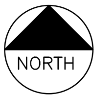
Block Plan Scale 1:500 @ A1

DESIGNERS RISK ASSESSMENT- HEALTH AND SAFETY THE CONSTRUCTION (DESIGN AND MANAGEMENT) REGULATIONS 2015 For significant hazards specific to the project please refer to Drawing CDM01 where appropriate