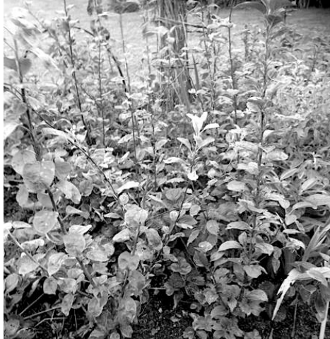
Some of our young apple trees in their nursery bed.

Looking forward to this year, there will be a seed swap in February, and a plant