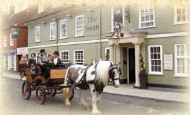
Regency Day carriage rides