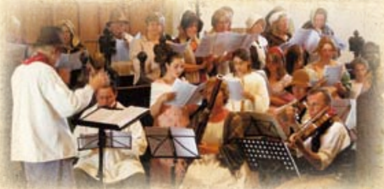
Madding Crowd and St Lawrence choir