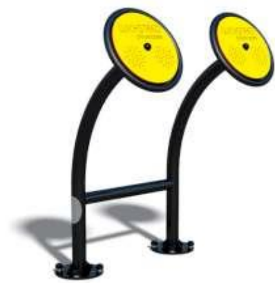
Two Wheel Spinner 6210-075