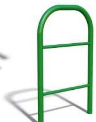
Hamstring Stretch 6210-092