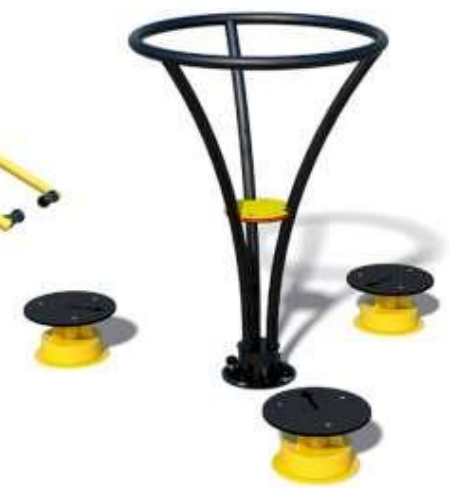
Body Twister 6210-067