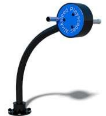
Inclusive Hand Bike 6210-071