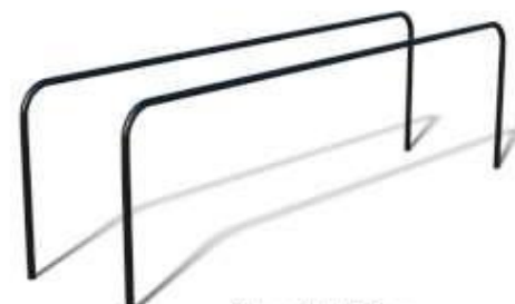
Parallel Bars 6210-096