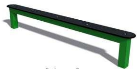
Balance Beam 6210-089