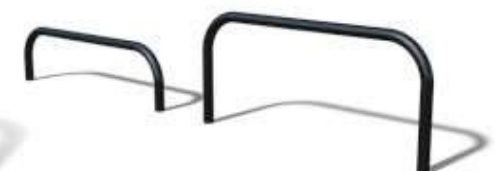
Push-Up Bar 6210-090