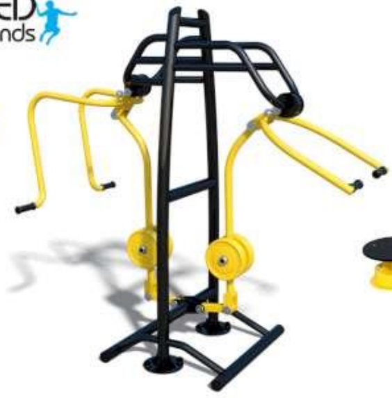
Inclusive Chest Press & Inclusive Pull-Down Combo 6210-059