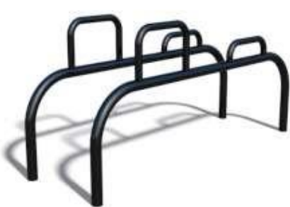
Dip Bar 6210-093