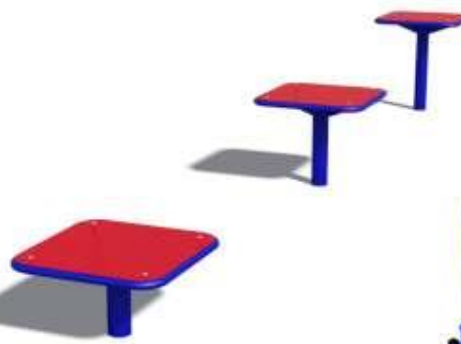
Plyometric Boxes 6220-022