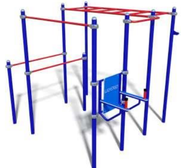
Calisthenics Static Fitness Zone 6230-001