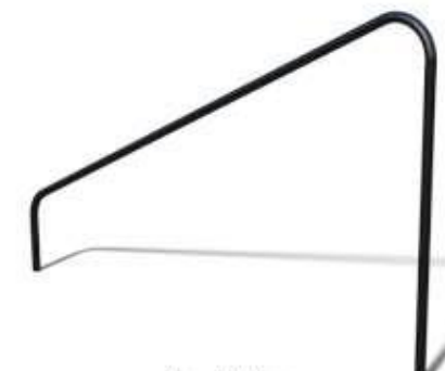
Vault Bar 6210-091