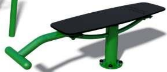
Single Sit-Up Bench 6210-062