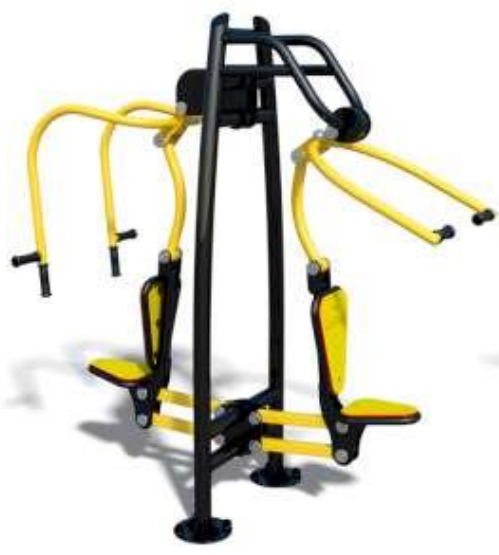
Chest Press & Pull-Down Combo 6210-058