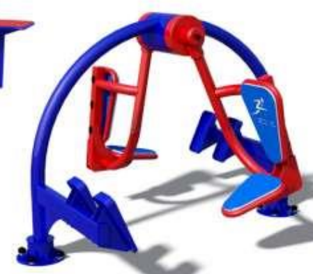
Double Leg Press 6210-061