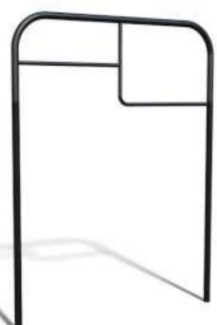
Pull-Up Bar 6210-088