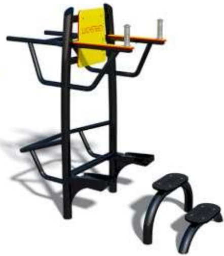
Step Box Multi-Gym 6210-066