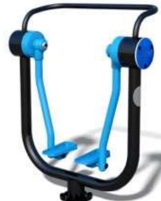
Space Walker 6210-087