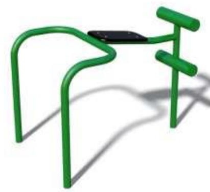
Hyper Extension Bench 6210-094