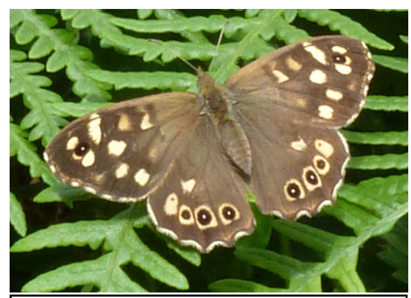
Speckled Wood: Very common on the hill, especially on The Drive, from Jubilee Wood up to the junction of Lyme Kiln Way.

I was really looking forward to doing the butterfly count, as last year there was an abundance of butterflies. I was confident that our survey would show how diverse and rich the hill's habitat is.