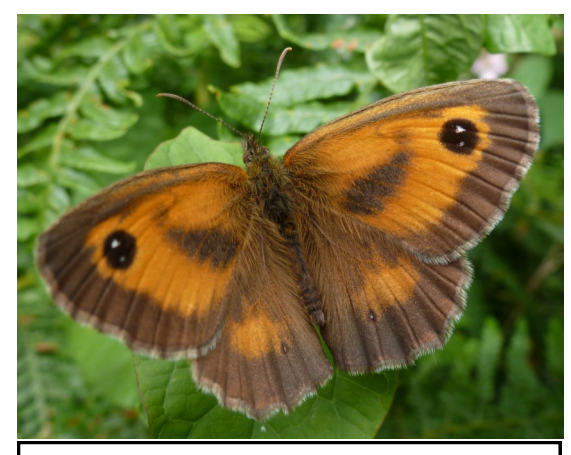
Gatekeeper: Not as common on the hill as some of the others and tends to enjoy the grassy slopes on the top.