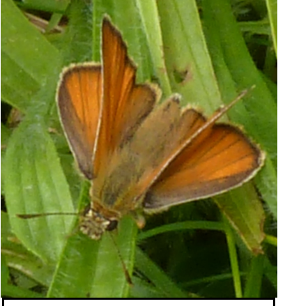
Small Skipper. This butterfly loves the south west facing grass slopes at the top of the hill. These are rich in wild flowers. It seems to fly very fast and I felt giddy trying to count them. There is also a rare Lulworth Skipper, which is found along the coast. Is this one below?