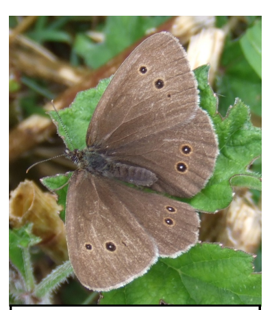
Ringlet. Usually is a lot darker in colour than this one. This photo does show the ringlet markings on the wings clearly. The most common butterfly on the hill at this time of year, especially in the long grass in the field.