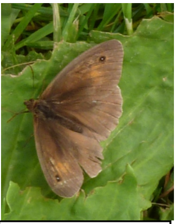
the colours are fading.