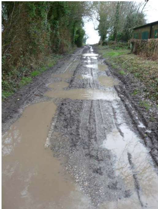
Looking North along footpath 7106a