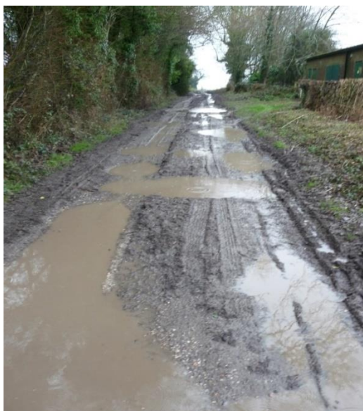
Berthas Lane: Flooding looking North

Any corrective work would aim to fill-in the pot holes and lay a 'new surface' using the HCC Countryside Services recommended materials as in our submission to the HCC SGS fund. These materials provide for drainage. However, we would need to use less material to limit the impact on the original budget set by the parish council and those funds available from the Lengthsman's Scheme.