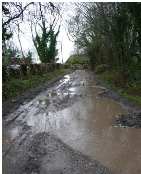
Berthas Lane: Flooding looking South

This approach has practical merit in achieving both the 'community need' and keeping up the momentum to significantly repair or resurface the footpath this year, and largely staving off further deterioration of the footpath. With an outcome of a useable pedestrian surface, Berthas Lane would be accessible again from a community perspective.