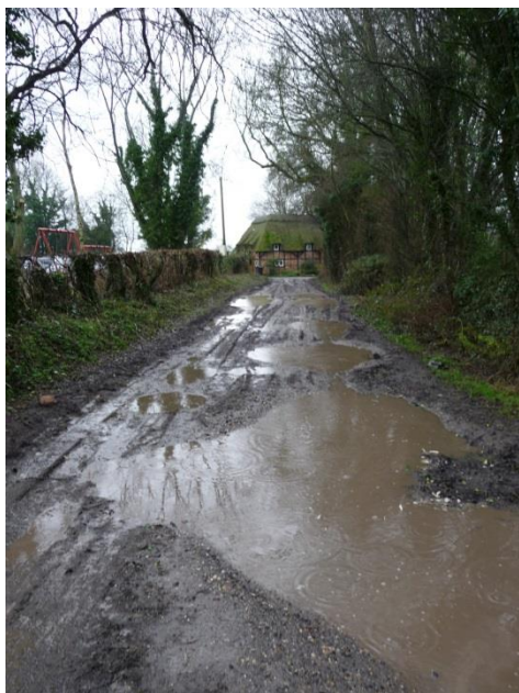
Looking South along footpath 7106a toward Bertha Cottage

replaced; the location of mapboards etc.). HCC can provide maps if required.