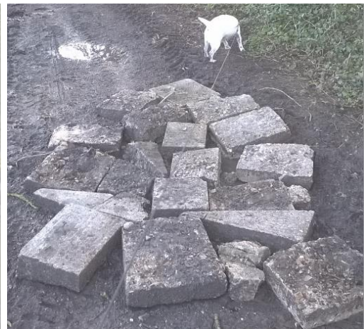
Berthas Lane: Concrete blocks February 2017

The recent weather has highlighted the recurrent drainage issues encountered on the footpath in Berthas Lane. See pictures taken below.