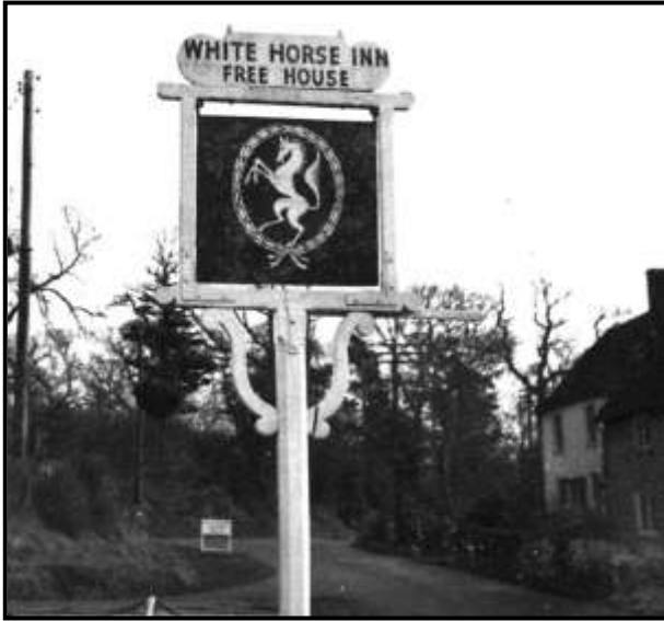
Photo of the White Horse pub sign in Sandway. Date of the photo unknown, but at least the pub was trading then, unlike today