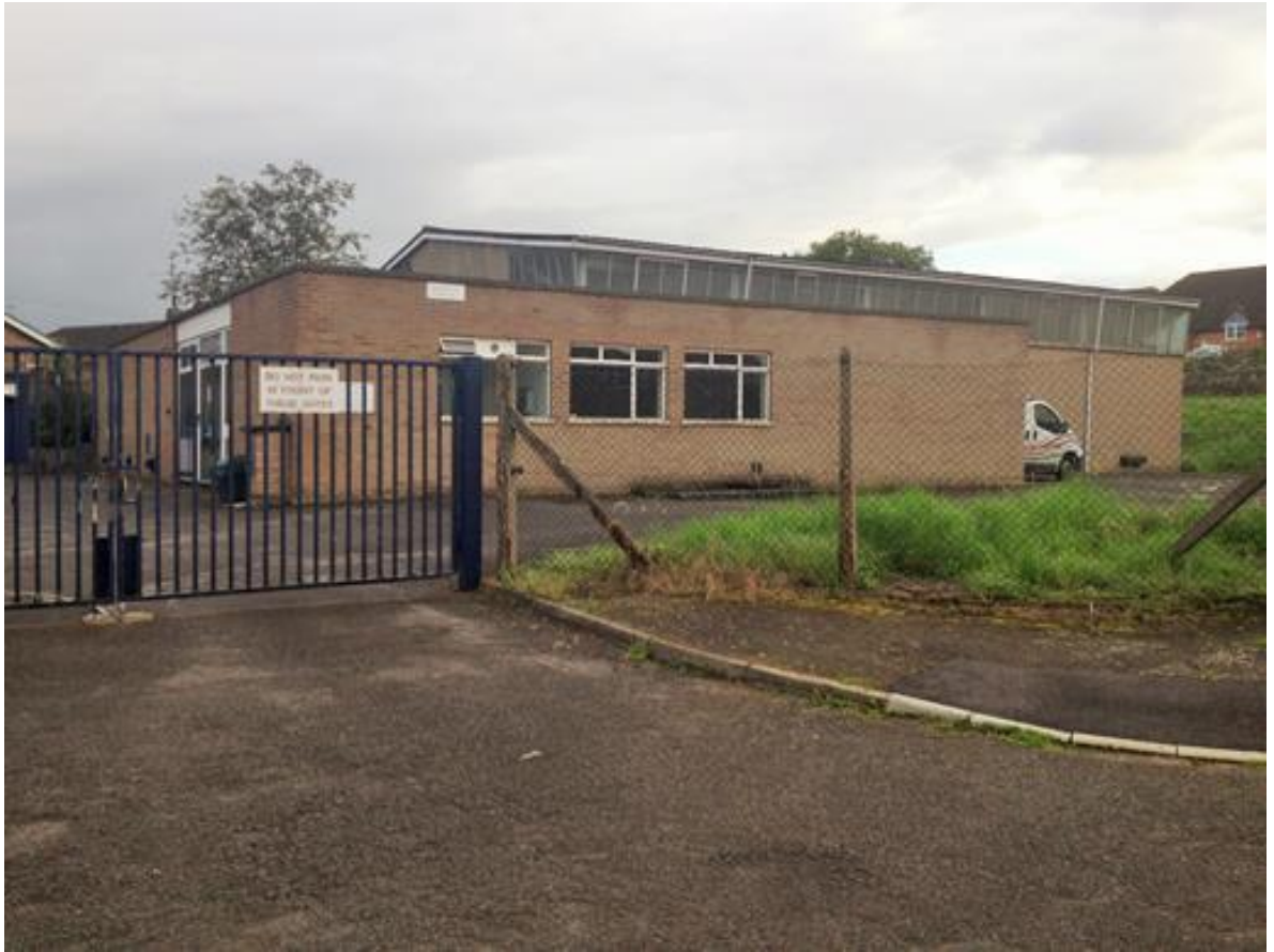
The existing BT Exchange in Church Street

The potential of the site will be a significant enhancement in Church Street