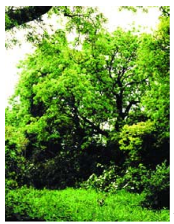
The established tree belt along Mount Pleasant is an important local landscape feature.