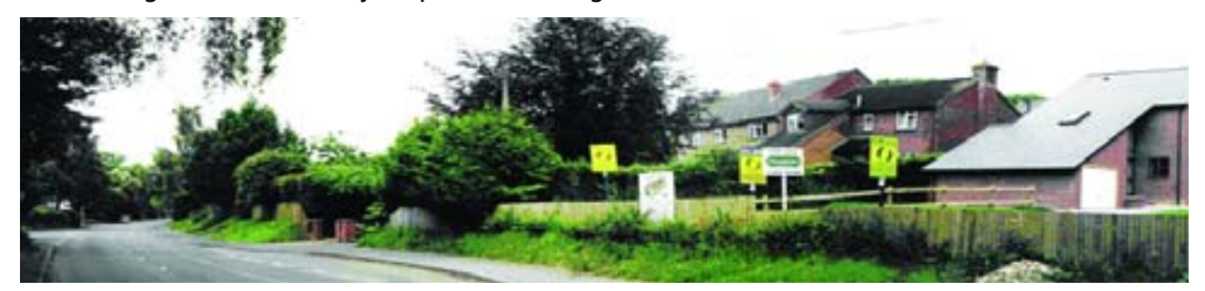
Looking west along Springvale Road. Note the loss of vegetation in front of the recent Crest View development in the foreground and the consequent change of character in the locality compared with the road beyond.

notably at the Crest View development close to the allotments on Springvale Road, that the benefits of roadside vegetation are appreciated. Without the roadside vegetation the effect is rather hard and bleak and the overall quality of Springvale Road is diminished, even though the houses may be pleasant enough.