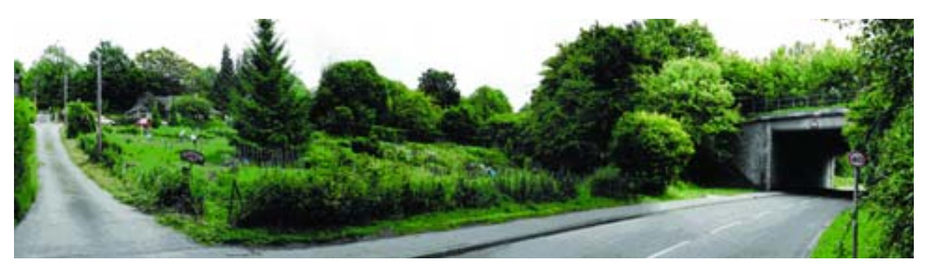
The allotments and A34 (T) bridge from Springvale Road. The allotments are a well-established feature and are generally valued by local residents. They also form a useful buffer against the busy A34 (T).

2.17 Another feature of the locality is the allotments situated on the east side of Springvale Road adjacent to the A34(T) embankment and bridge. The allotments have a generally open boundary to Springvale Road, and situated on rising ground they are a distinctive part of the local scene. Whilst allotments are not generally regarded as being of an particular landscape value, it is clear from comments received during the study that local residents generally value them both as a long-established part of the local scene and for their visual interest and amenity (it is understood that the allotments are currently fully occupied with a waiting list).