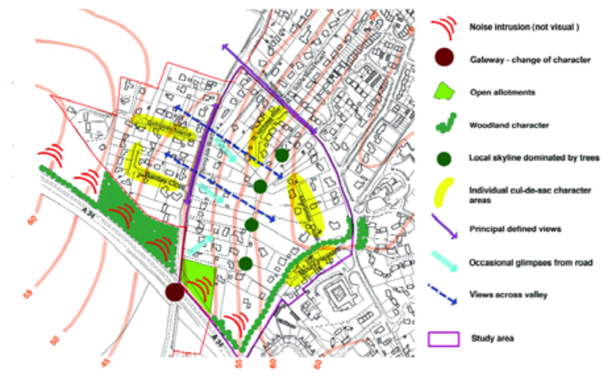
Figure 4: Analysis Drawing

2.21 In marked contrast to the other two cul-de-sacs, St. Nicholas Rise represents a small development typical of its period. The general effect is of a pleasing suburban environment supported by the considered design of the houses, the slope and the amount of vegetation. However, the open frontages make it very different in character from the more reticent effect of other older development around the Springvale Road locality.