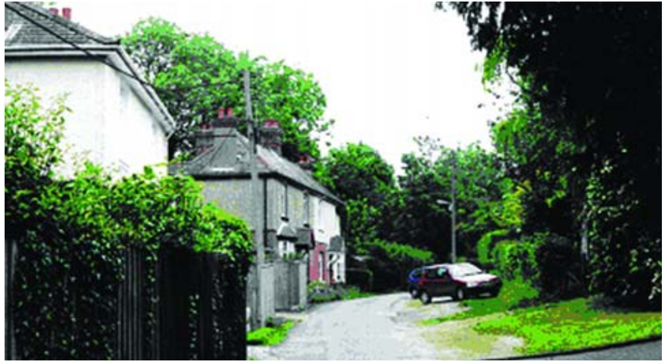
Mount Pleasant has a distinct local character. Care must be taken to ensure its quiet bucolic character is not adversely affected and that any nearby development is sensitive to its context.