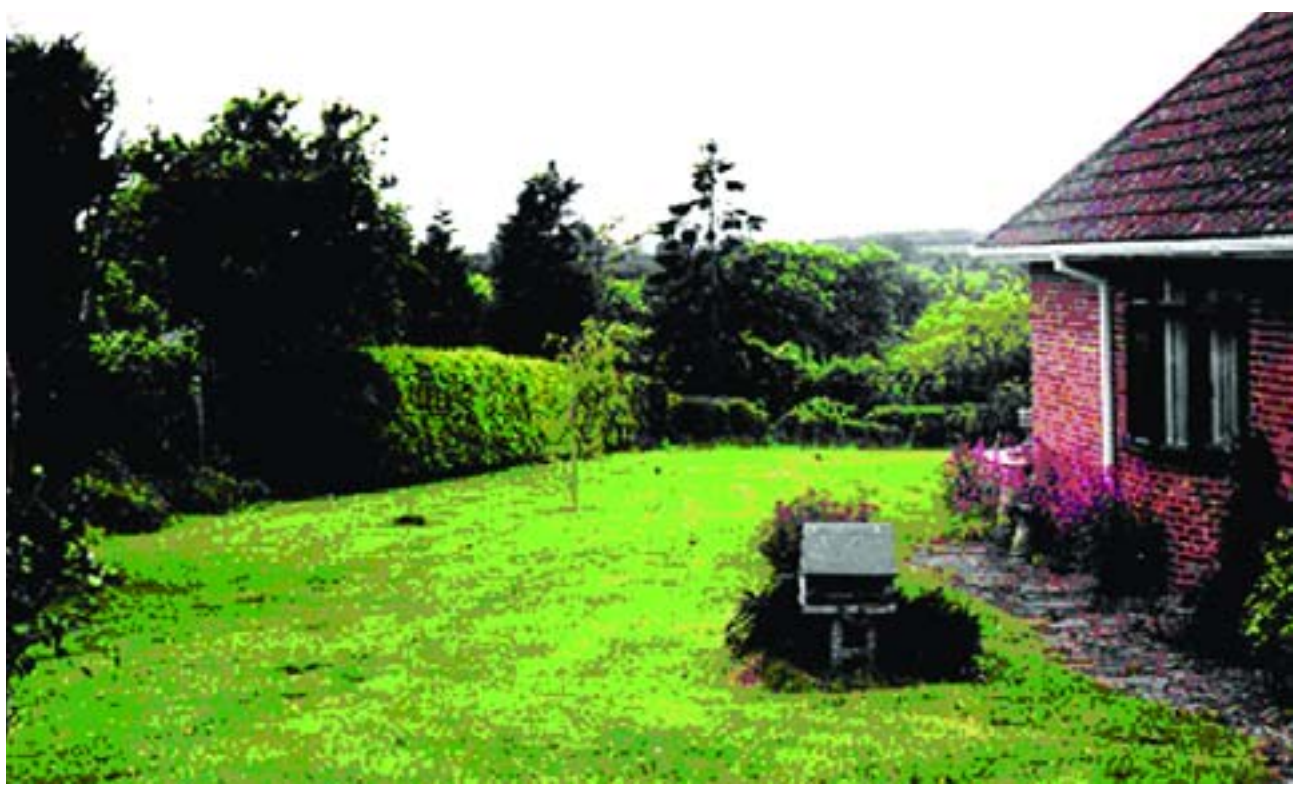
Glimpsed views west to open country across the valley are a feature of houses along Mortimer Close.

2.20 Mortimer Close has a much more typical suburban quality, with a wider and more formal paved road. Houses are discrete as seen from the road and largely hidden from view. Of more particular interest are the occasional glimpses towards open country to the west.