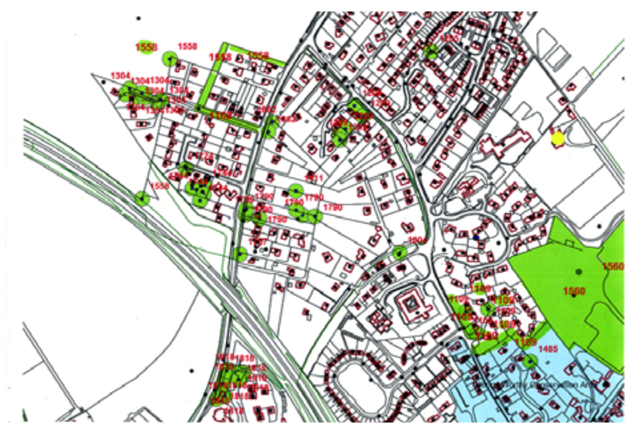
Figure 3: Tree Preservation Orders

2.15 Elsewhere the trees are generally smaller and less visually important. Nonetheless the extent and manner of vegetation in and around Springvale Road is an important feature that contributes positively to the overall impression of suburban and semi-rural leafiness. Situated on rising ground, the Springvale Road Study Area is visible in local views from the west, but the amount of tree cover across the area generally, including some wellestablished hedges, succeeds in losing built development during the summer months (and probably to a large degree during the winter months as well), creating the appearance of a semi-wooded hillside with occasional glimpses of houses.