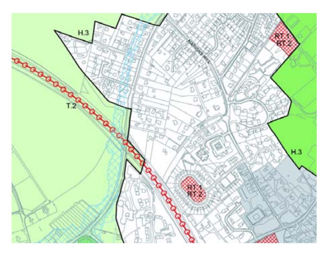
Figure 2: Local Plan Extract