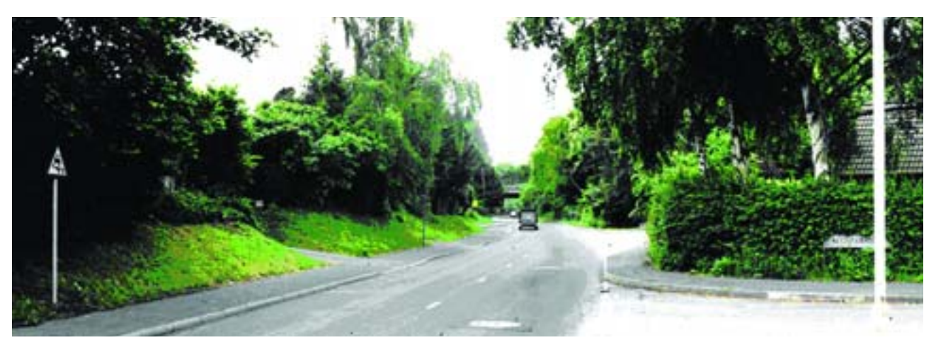
Looking east down Springvale Road. During summer months the density of vegetation on either side of the road all but obscures forward views of the houses behind.

2.15 Elsewhere the trees are generally smaller and less visually important. Nonetheless the extent and manner of vegetation in and around Springvale Road is an important feature that contributes positively to the overall impression of suburban and semi-rural leafiness. Situated on rising ground, the Springvale Road Study Area is visible in local views from the west, but the amount of tree cover across the area generally, including some wellestablished hedges, succeeds in losing built development during the summer months (and probably to a large degree during the winter months as well), creating the appearance of a semi-wooded hillside with occasional glimpses of houses.