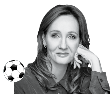
J.K. Rowling 1965 –

Or perhaps in Slytherin You'll make your real friends, Those cunning folks use any means To achieve their ends.