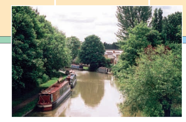
The Grand Union Canal, Cosgrove