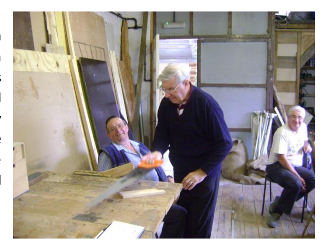
Starting work on building a new work-bench.

See visit <u>www.fromeshed.org.uk</u> for details of membership.