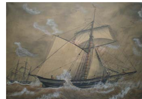
A Hamble crab & lobster boat in an Irish Sea snow storm 1822

When at Hamble they were kept alive in large wooden vessels or boxes known as carbs but they could only be kept for a limited period and the London markets wanted an equitable supply and not all at once. Therefore, at the beginning of the 1850s the Scovell fishing merchant family spent £1,300 on constructing a crab and lobster pond at Hamble Point to preserve a large quantity of shellfish until there was a demand from the metropolitan markets. The lobster pond was said to be able to hold two to three hundred thousand shellfish. A small house was built next to it for a man to live in to feed the shellfish. If they were not