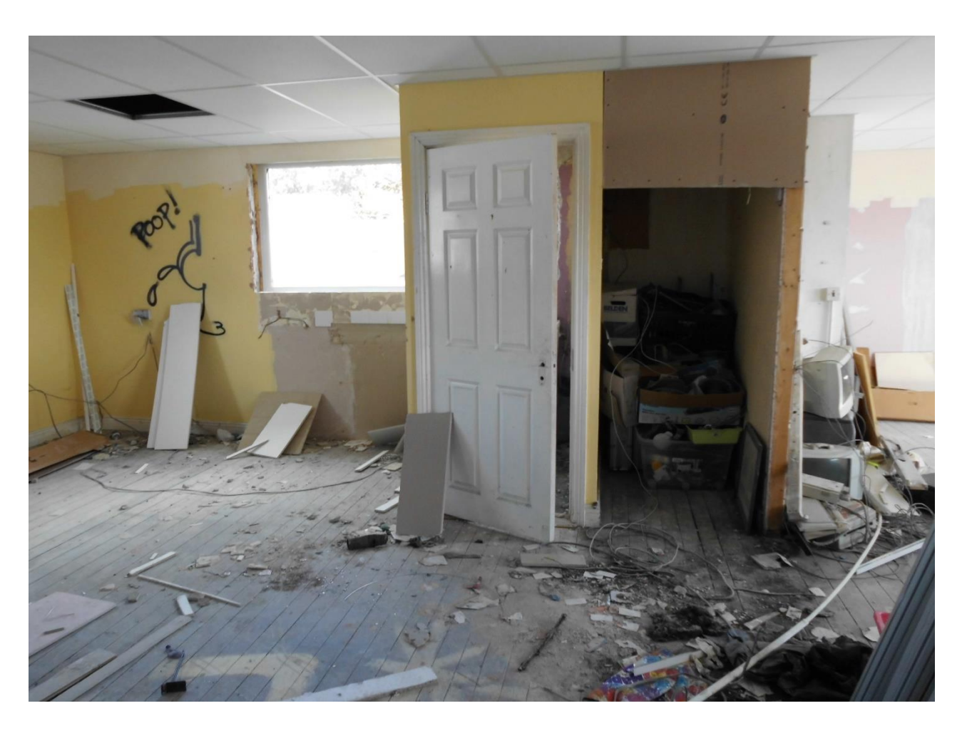
The Social Area June 2015