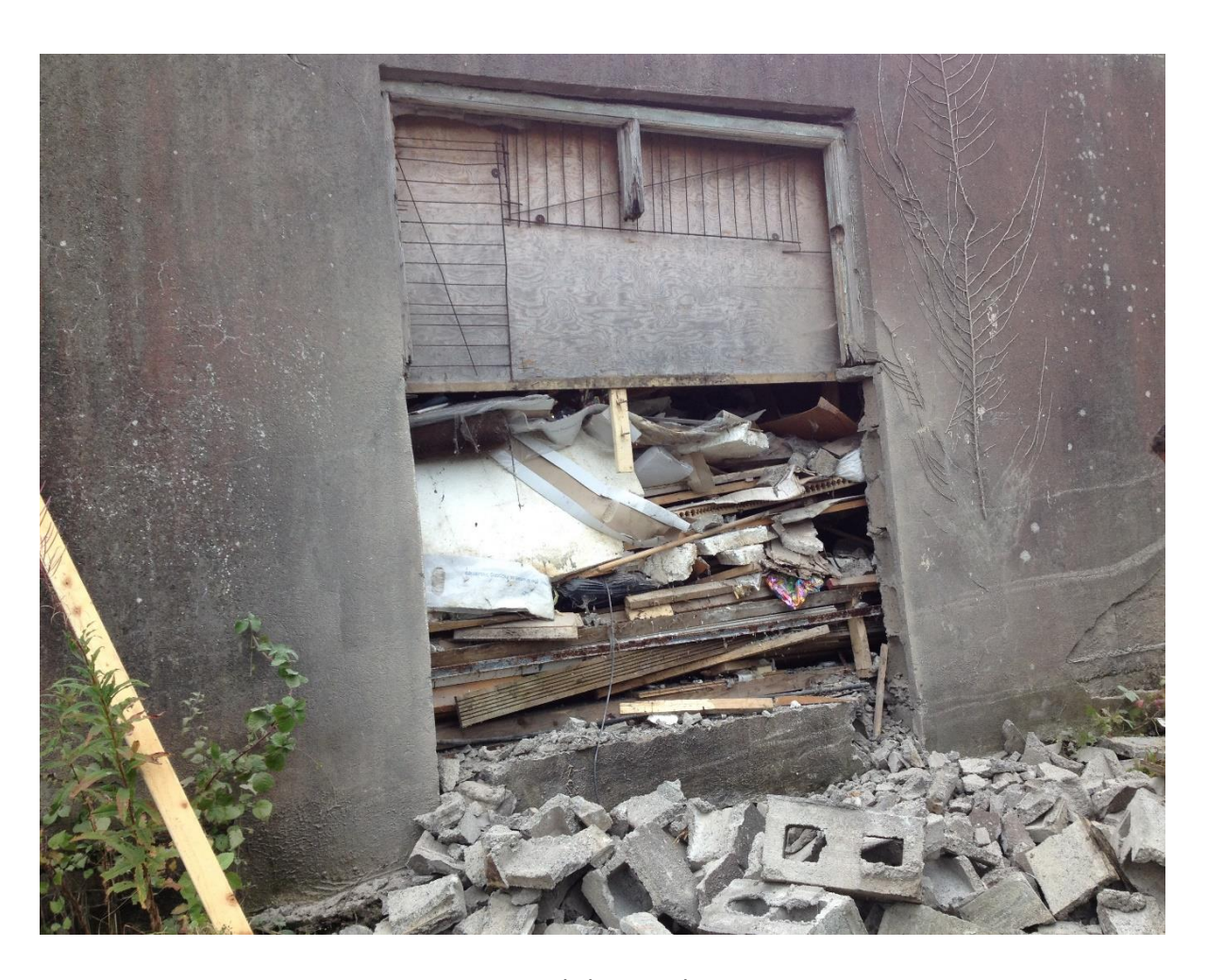
Workshop early 2015