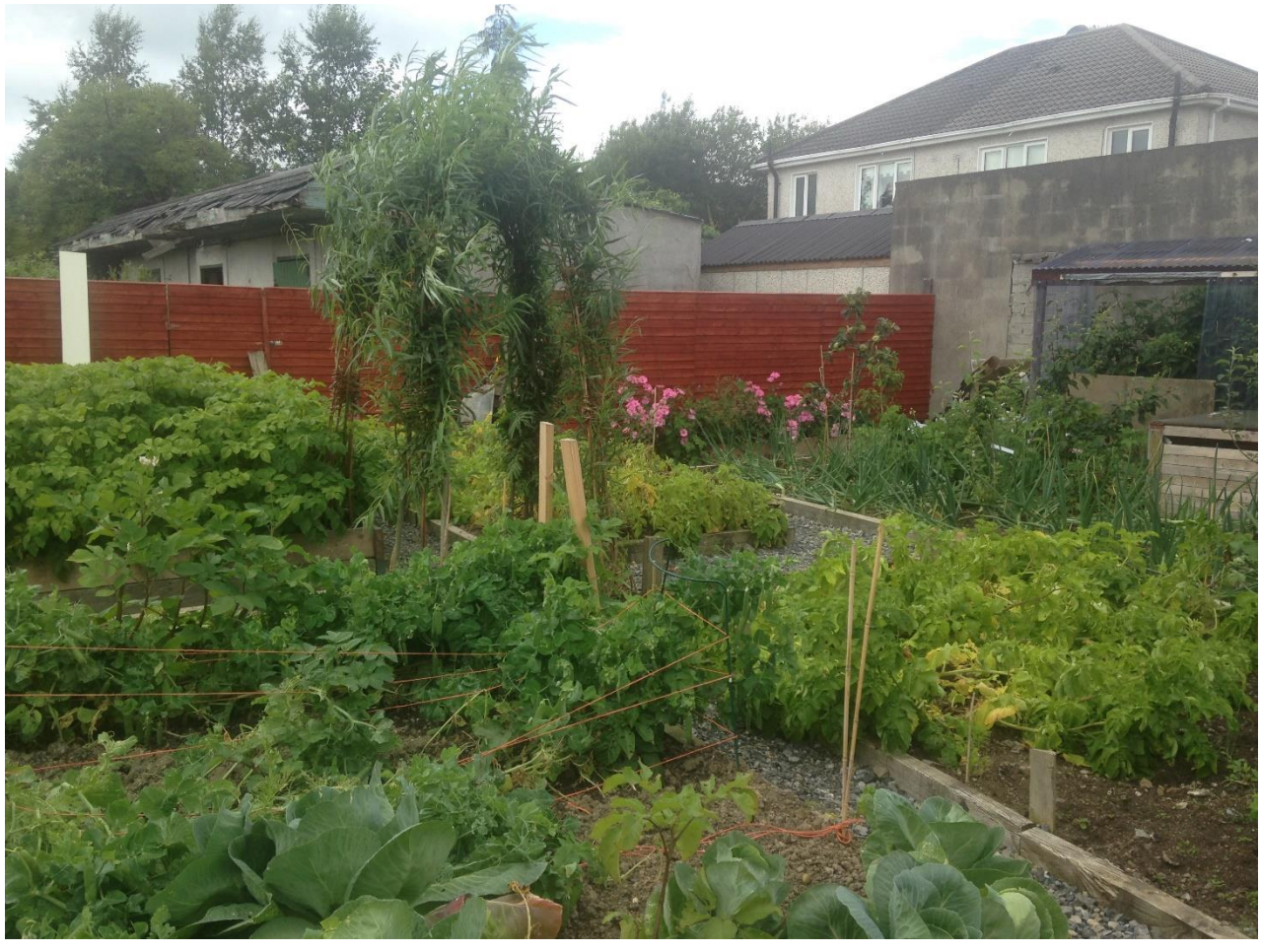
The Garden June 2016