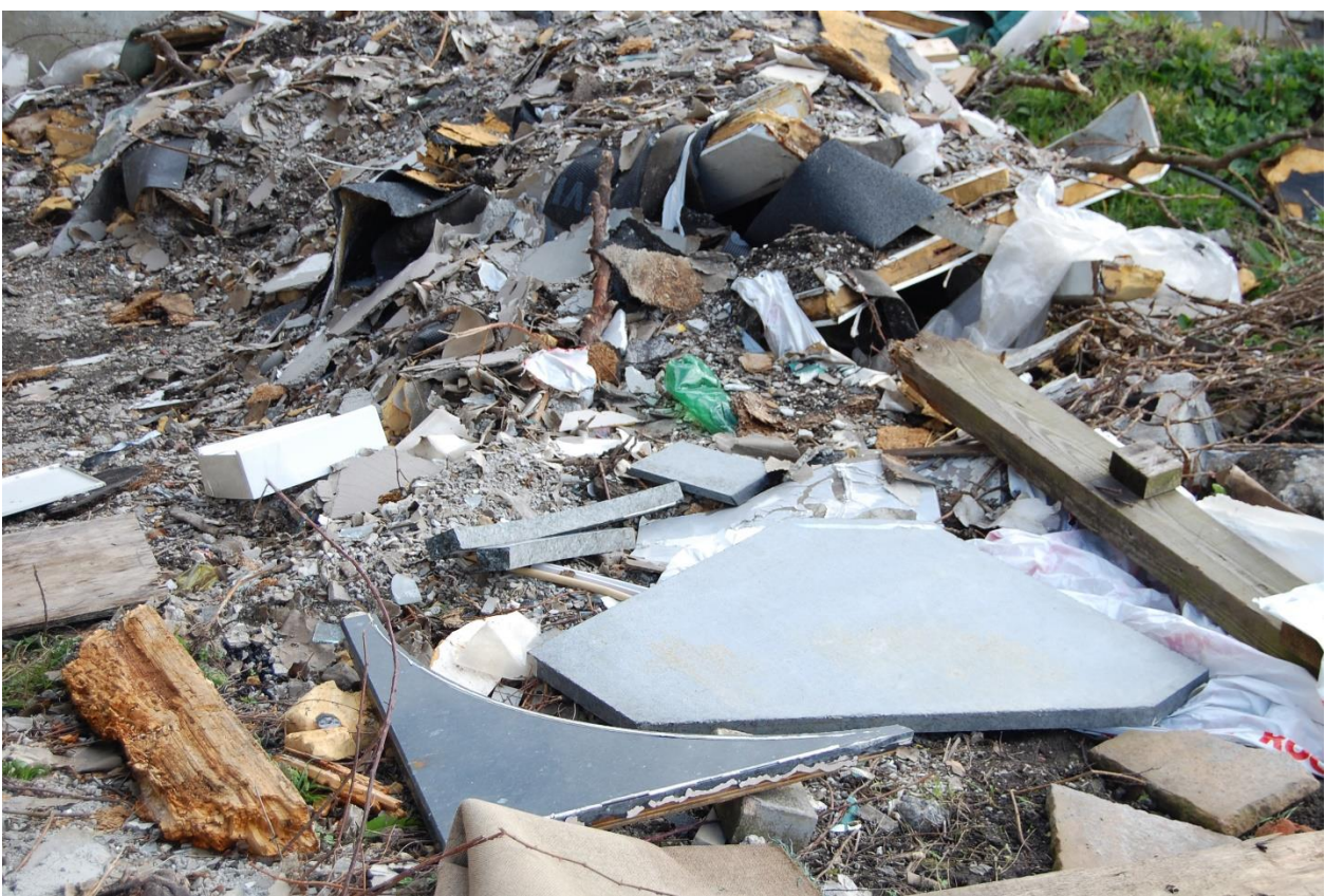
The Garden early in 2015