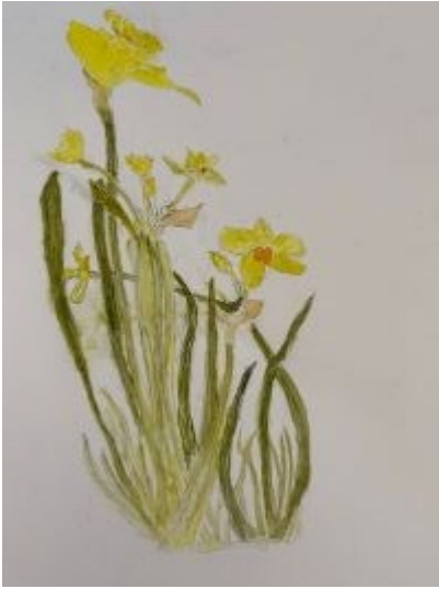
Spring flowers: Carol , watercolour.