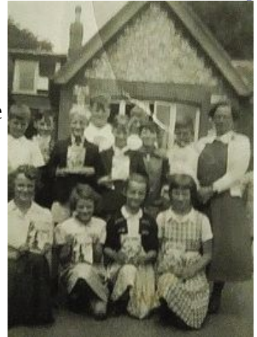
I am second left in the back row.

Unfortunately, some of them are probably no longer with us. I have wonderful memories of childhood in St. Cross Water Meadows and of trainspotting at the local level crossing. A hobby that I still enjoy. We all have memories and where possible, hold on to them as they are so precious. We all at the same time wish we could start again, but I am happy with today, especially because I have a wife I adore, and a wonderful family. I feel very privileged.