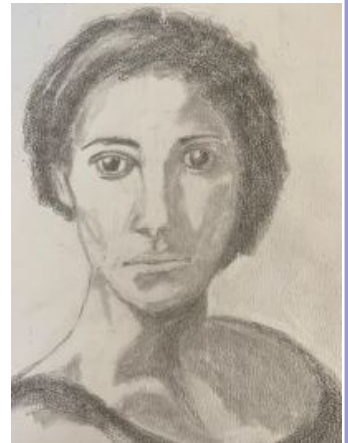
Portrait of a young Woman: Frank pencil & charcoal.