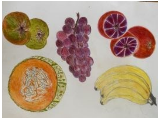
Fruit Salad: Sheila, watercolour .