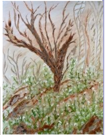
Snowdrop wood: Jenny, watercolour.