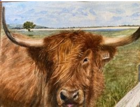
Hayling Highland: Denise, watercolour.