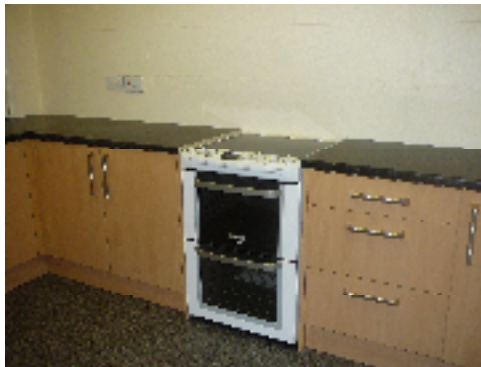
The new village hall kitchen is taking shape!