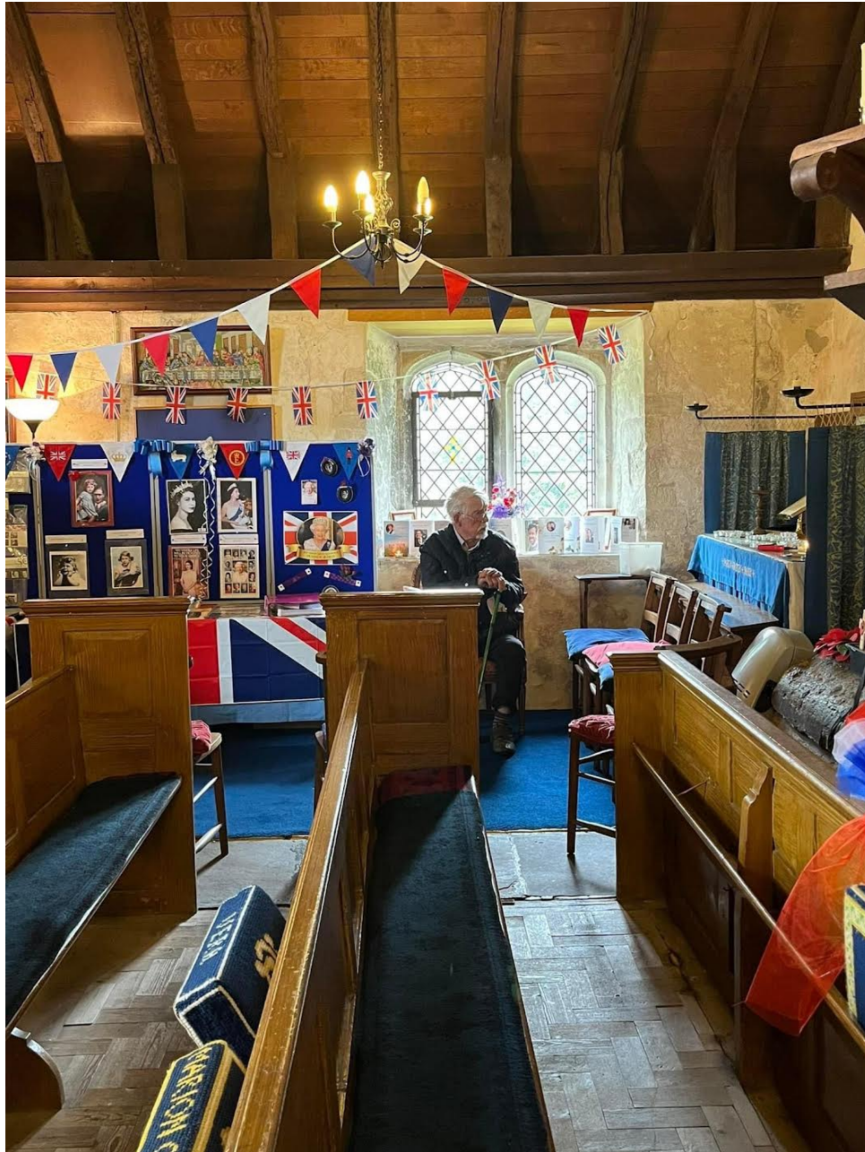
Jubilee exhibition at St Margaret's

Compiled, edited and published for the village on behalf of St Margaret's Church