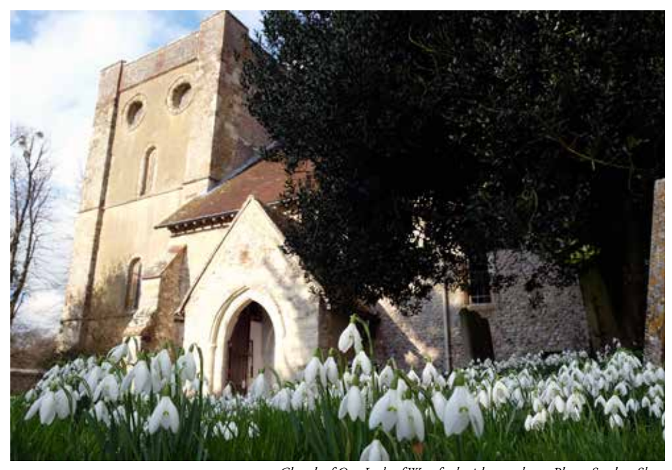
Church of Our Lady of Warnford with snowdrops.