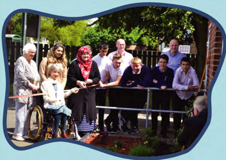
In 2018, as part of a school project, a group of the pupils of Heltwate St George's School designed and constructed a fabulous new garden area for customers to enjoy.