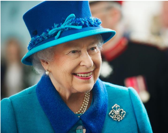
Her Late Majesty Queen Elizabeth II