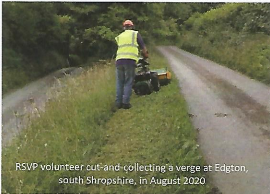
RSVP volunteer cut-and-collecting a verge at Edgton, south Shropshire, in August 2020

Instead, managing verges as mini-hay meadows would store carbon, replenish the seed bank, restore floral diversity, save the Council money, create habitat and provide nectar and pollen.