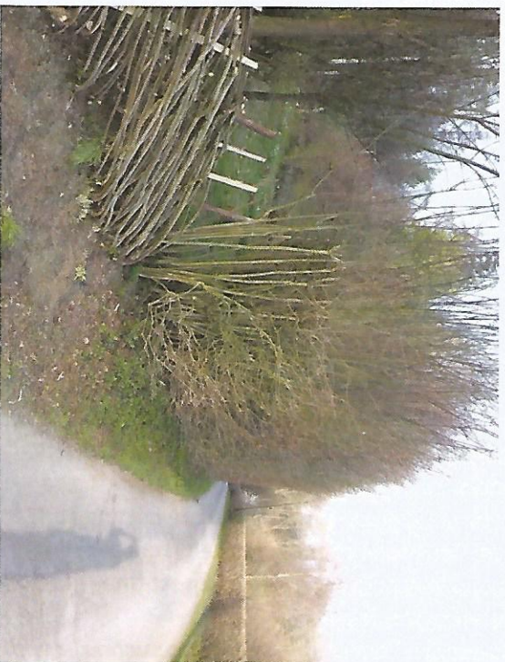
Tall Hedge laid exposing new verge