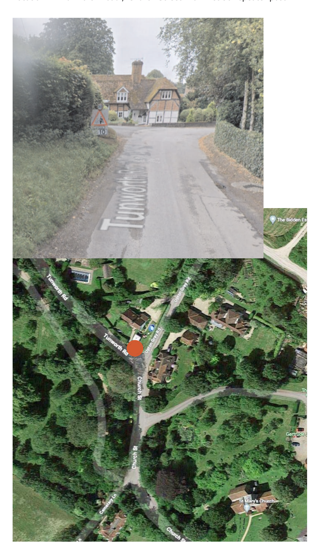
Location 2 – Tunworth Road / Church Street N on first 30 repeater post