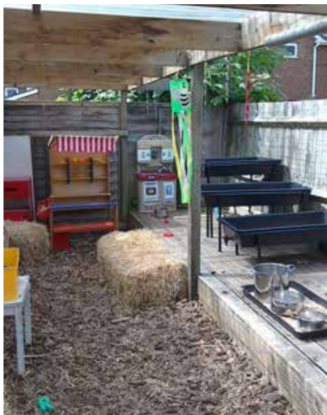
Outside undercover play area

The playschool has a colourful open air playground, an outside undercover play area and a pirate ship for the children to play on.