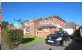
Hamble OIEO £369,950